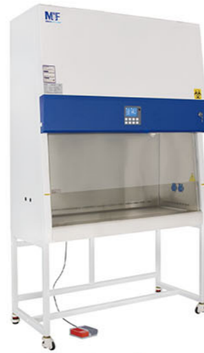
Button Screen Type

Touch operation, real-time and clearer display of various values and appointment timing function.