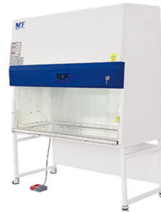
Color Touch Screen Type