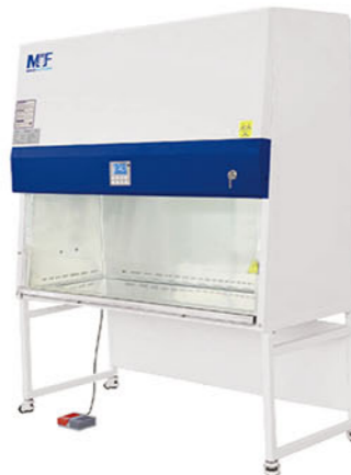
Button Screen Type